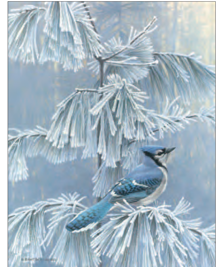
FROSTY MORNING – BLUE JAY © Robert Bateman ClasArt® $895 350 s/n plus 70 Artist's Proofs* 20" x 15-7/8" (FROS0004) (A 950 s/n offset paper edition has previously been published. Publisher Sold Out.)