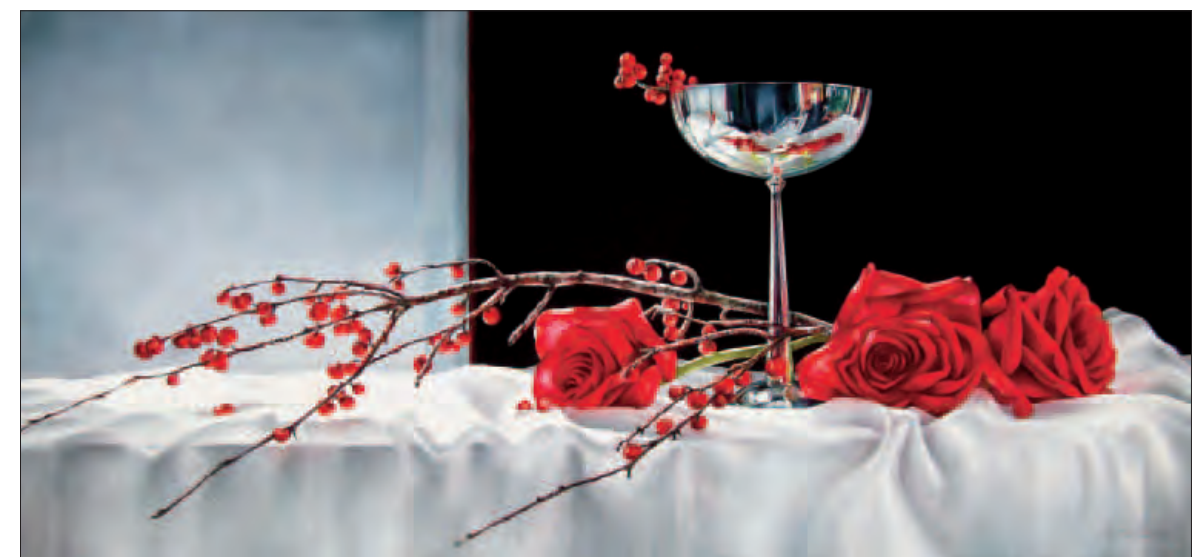
WINTER BERRIES © Arleta Pech Giclée Canvas $450 180 s/n plus 40 Artist's Proofs* 15" x 31" (WINT0113)

"The white linen reminded me of snow, so this painting took shape on a frosty day as the light reflected another world into the silver goblet."