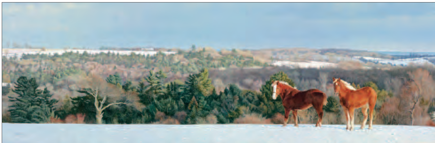
WINTER BOUNDARIES © Brent Townsend Giclée Canvas $695 180 s/n plus 40 Artist's Proofs* 16" x 48" (WINT0115)

Winter has a magic all its own. In its pale sunlight, long shadows extend over a landscape once hidden.