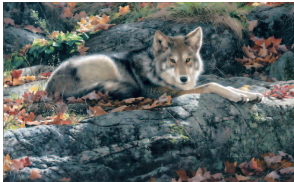
COZY LEDGE – COYOTE © Patricia Pepin Giclée Canvas $495 180 s/n plus 40 Artist's Proofs* 12" x 19" (COZY0003)