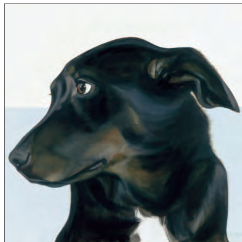
IN THE RUFF - WISTFUL © Gretta Gibney Giclée Canvas $795 180 s/n plus 40 Artist's Proofs* 30" x 30" (INTH0061)