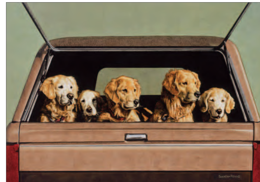
TAILGATE PARTY © Sueellen Ross Giclée Canvas $295 180 s/n plus 40 Artist's Proofs* 10" x 15" (TAIL0001)

"My friends (who breed golden retrievers) took all their dogs on a late afternoon outing. Everybody was pretty excited, though the older dogs have learned to curb their enthusiasm — at least on the outside."