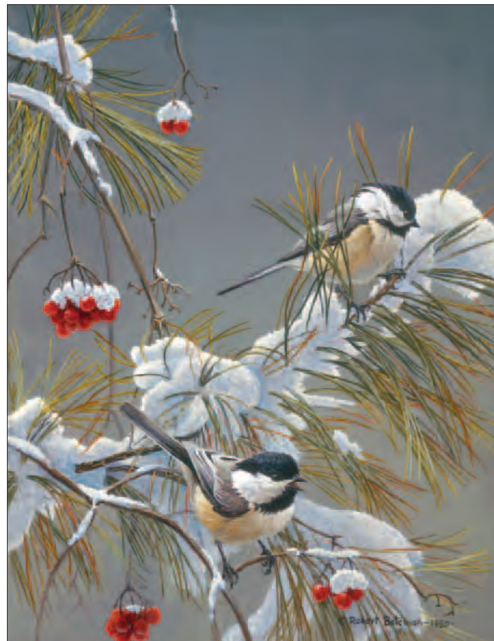
WINTER SONG – CHICKADEES © Robert Bateman ClasArt® $695 350 s/n plus 70 Artist's Proofs* 13-1/8" x 10" (WINT0117) (A 950 s/n offset paper edition has previously been published. Publisher Sold Out.)

If you love the thrill of seeing an original painting by your favorite artist at a museum or gallery, just imagine how you'll feel seeing ClasArt® in your home or office where you can enjoy it each and every day. There is only one place to see just how exquisite this new art form is – call your authorized Mill Pond Press gallery today to reserve your very own ClasArt® prints. (Prepare to be awed!)