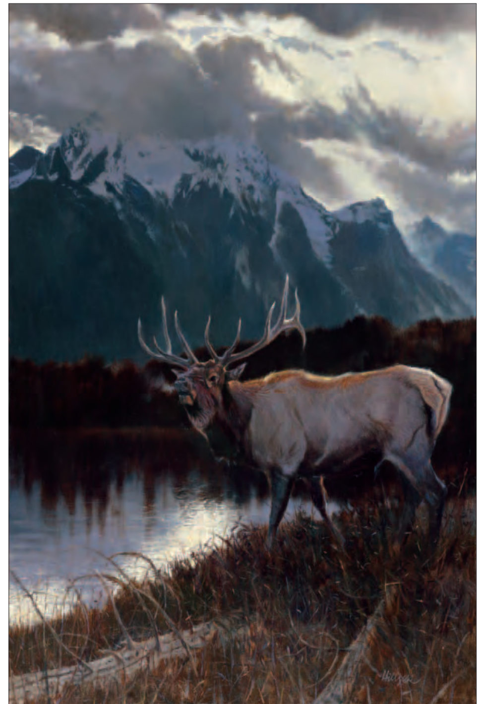
MAJESTY © Matthew Hillier Giclée Canvas $695 180 s/n plus 40 Artist's Proofs* 36" x 24" (MAJE0002)

"For me, there is nothing that conjures up the drama and majesty of the Rockies more than a lone bull elk, bugling from a mountain side. That eerie mountain music that echoes throughout the landscape is so haunting."