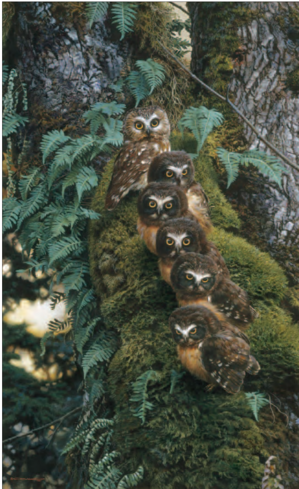
THE FAMILY TREE © Carl Brenders Giclée Canvas Renaissance Edition $895 195 s/n plus 40 Artist's Proofs* 37" x 23" (FAMI0007) (A 3,500 s/n offset paper edition has previously been published. Publisher Sold Out.)

This remarkable Renaissance Edition faithfully reflects the luminous detail and trademark texture found in Brenders' unparalleled art.