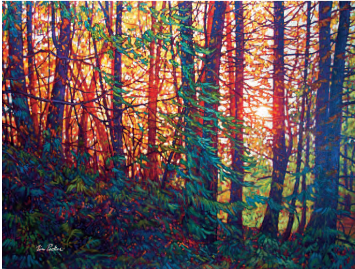
TANGLED FOREST © Tim Packer Giclée Canvas $1,295 50 s/n plus 10 Artist's Proofs* 36" x 48" (TANG0003) Giclée Canvas $895 50 s/n plus 10 Artist's Proofs* 30" x 40" (TANG0001)