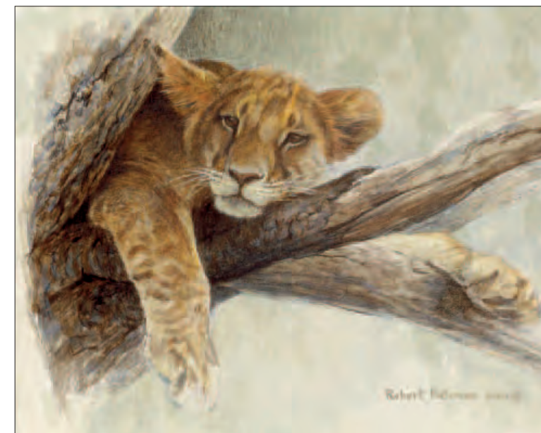
UP A TREE – LION CUB © Robert Bateman ClasArt® $595 350 s/n plus 70 Artist's Proofs* 8" x 10" (UPAT0003) (A 950 s/n offset paper edition has previously been published. Publisher Sold Out.)

Like all babies, most young animals play until they simply run out of steam, as was the case with this adorable lion cub.