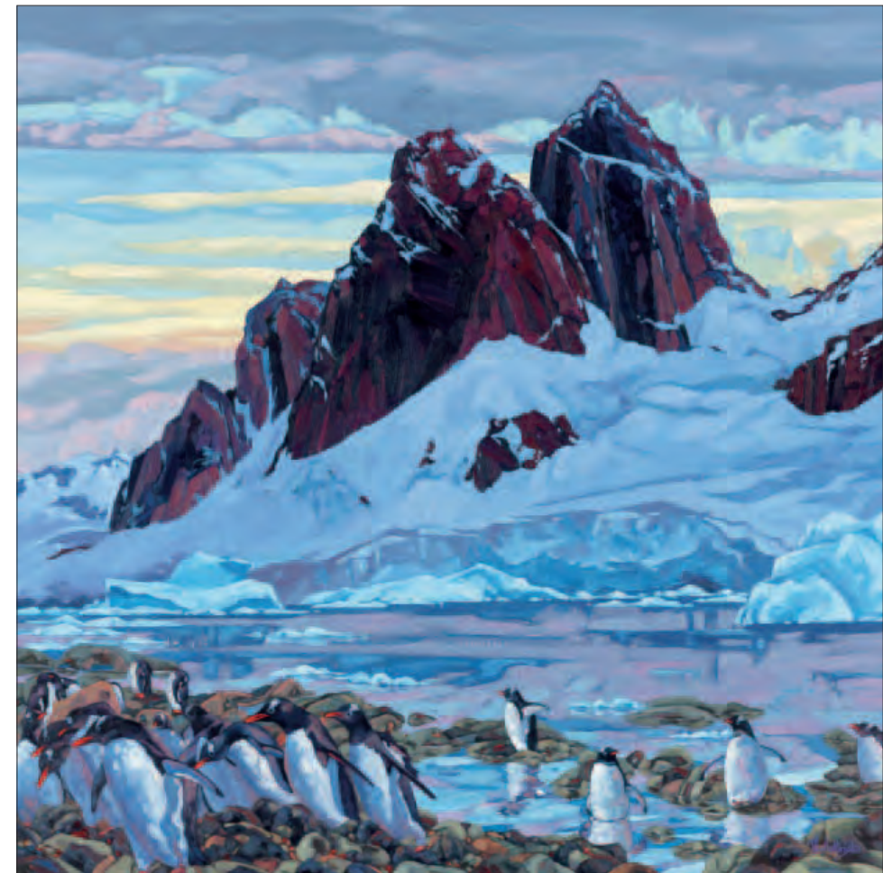
RUSH HOUR © Dominik J. Modlinski Giclée Canvas $895 180 s/n plus 40 Artist's Proofs* 32" x 32" (RUSH0001)

Here's one traffic tie-up that will put a smile on your face! Dominik Modlinski perfectly captures the colorful, comical chaos as a group of penguins hurries along like five o'clock commuters heading home from an office high-rise. In this case, the skyscrapers are snow covered mountain peaks illuminated by the setting sun.