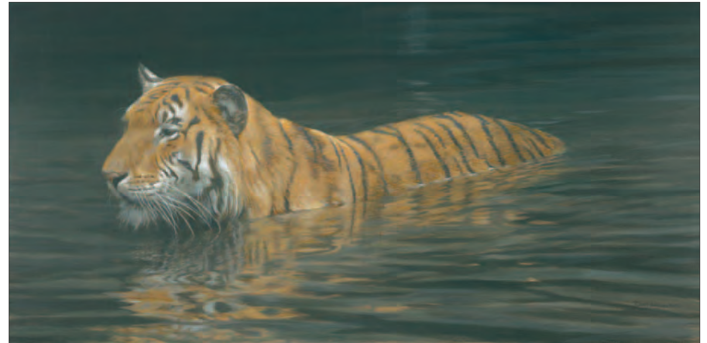
RIVER FORD – TIGER © Robert Bateman Giclée Canvas $995 195 s/n plus 40 Artist's Proofs* 24" x 48" (RIVE0023)

As he glides through the water, the tiger's reflected stripes seem to dissolve into an abstract pattern carried on the current.