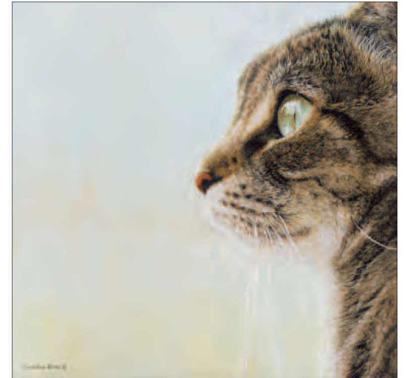
JUST LOOKING © Sueellen Ross Giclée Canvas $295 180 s/n plus 40 Artist's Proofs* 11" x 11" (JUST0012)

"I've deleted any visual clues from the background, to echo the enigma of the cat's state of mind. It could be sunup, sundown, a world of dreams — it could be anytime or anywhere."