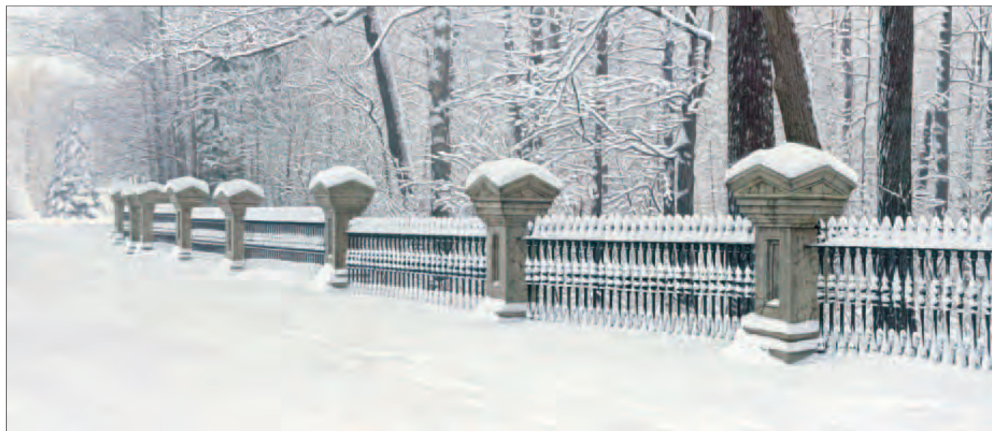
AFTERGLOW © Brent Townsend Giclée Canvas $995 180 s/n plus 40 Artist's Proofs* 18" x 40" (AFTE0014)