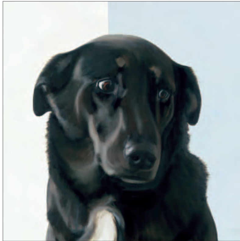
IN THE RUFF - GUILTY © Gretta Gibney Giclée Canvas $795 180 s/n plus 40 Artist's Proofs* 30" x 30" (INTH0059)

"I believe that dogs are complicated creatures that, like humans, have many different and varied aspects of their personalities. I am using one dog to portray different forms of expression which I think are universal to all dogs."