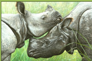
Ying & Yang