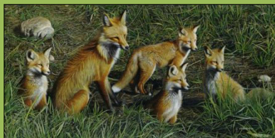
The Fox Den