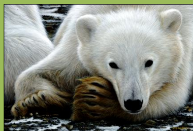
Spirit of Little Bear