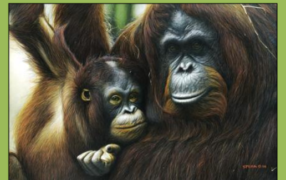
Orangutan Mother & Young