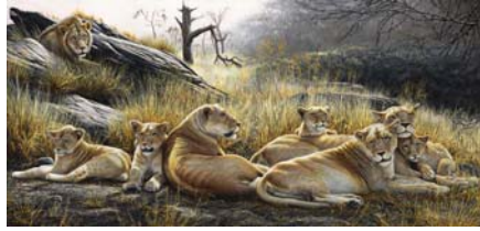
The Pride – African Lions