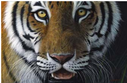
Heir To The Throne – Bengal Tiger