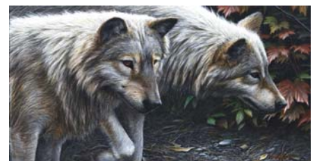
Back To Base – Timber wolves

As response to Edward's gallery increases with every passing day, he has